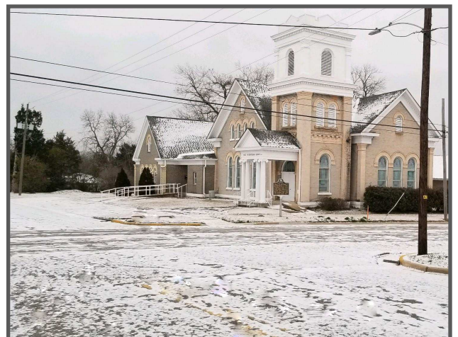
Snow-Day, February 16, 2021.