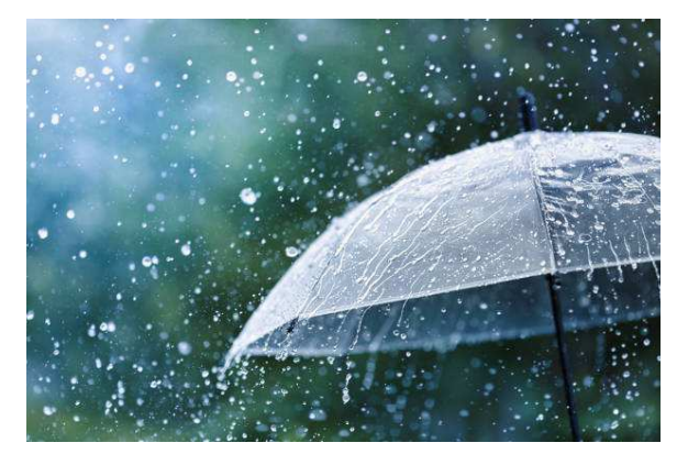
My eyes shed streams of tears, because people do not keep your law. Psalm 119:136